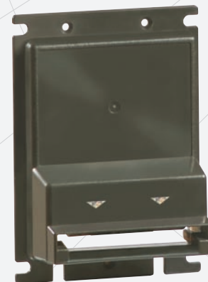
Optional Snack Mask

High quality reflection and transmission sensors ensure an optimum security against counterfeits. All sensors are integrated in the back side of the acceptor to protect them from environmental impacts.