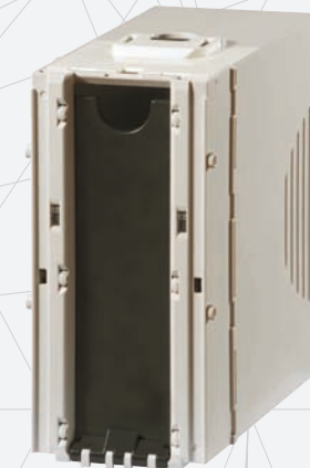
Optional cashbox for 1000 banknotes