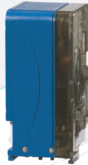
Revolutionary banknote recycling unit RC-10